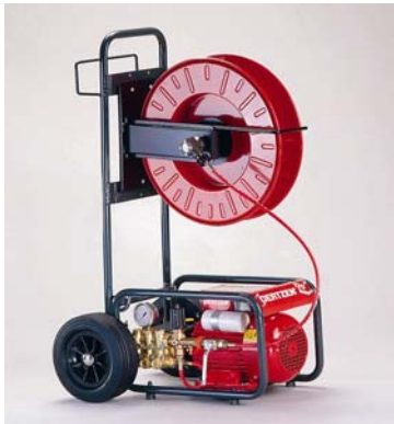
High Pressure Cleaners 312P 220V 60Hz 170Bar 660 l/h 312P 220V 50Hz 170Bar 660 l/h 312P 440V 60Hz 170Bar 660 l/h