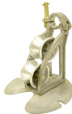
Tank Cleaning Hose Saddle 590682 Base : 400mm