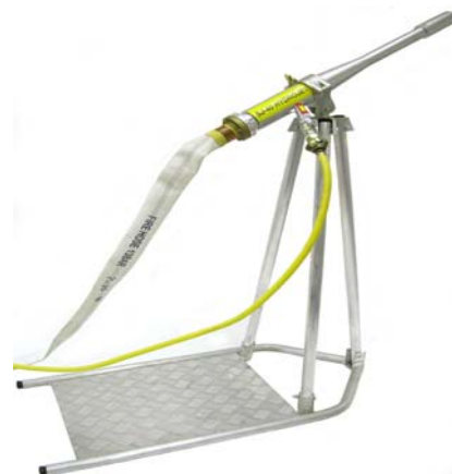
Hydrojet Hold Cleaning Gun 590741 with platform 590742 with tripod