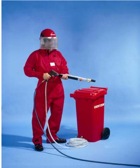
Water Sandblasting Kit 5907x for 500Bar Cleaners