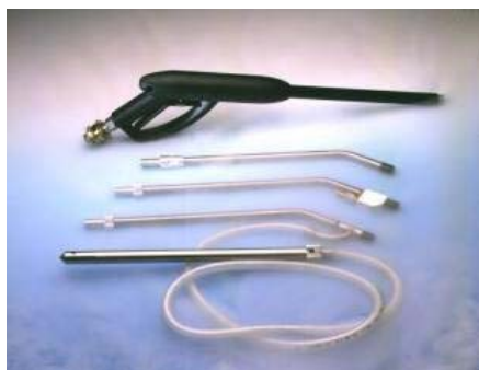
Air Driven Universal Cleaner •Compressed Air •Compressed Air & Water •Sandblasting