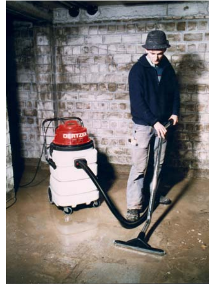
Vacuum Cleaner Wet & Dry 590712 220V – 50/60Hz