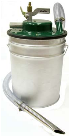
Pneumatic Vacuum Cleaner 590721 5HP w/2 mtr Hose