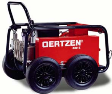
High Pressure Cleaners E500 440V 60Hz 500Bar 1620 l/h E500-17 440V 60Hz 500Bar 1020 l/h