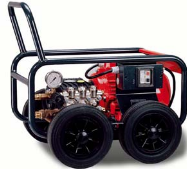
High Pressure Cleaners E200-16 440V 60Hz 230Bar 1200 l/h